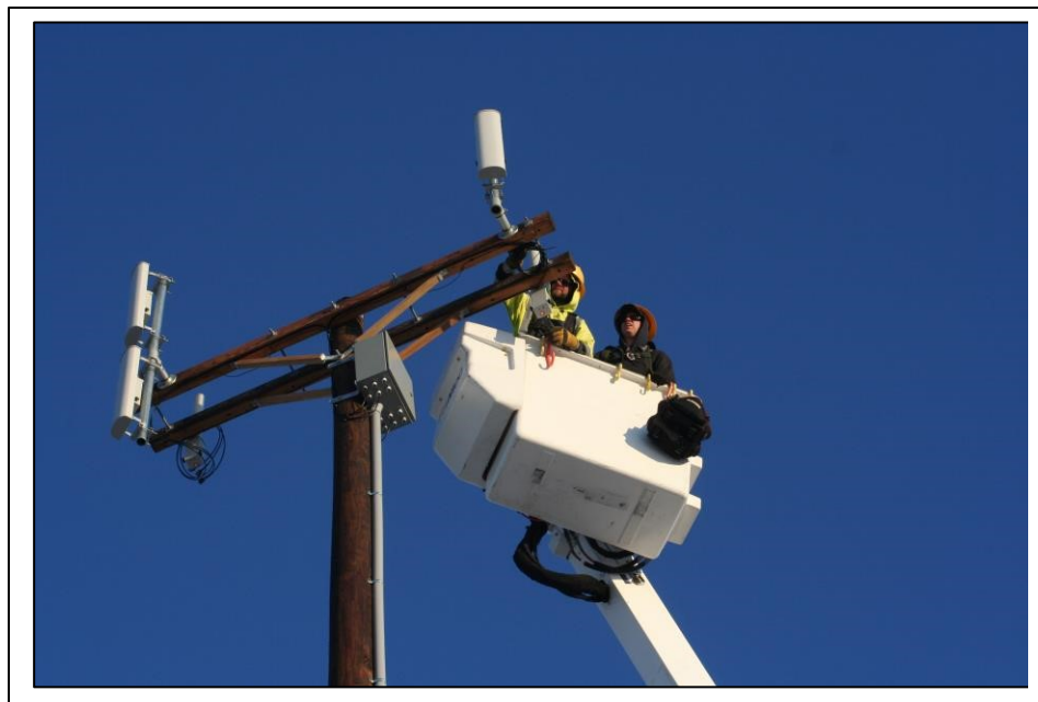
Figure 2. Workers installing wireless broadband equipment on pole

ACEC’s approach to filling the gaps in broadband coverage in rural, northeast Iowa is based on demonstrated need and is scalable. It relies on hybridized network architecture and deploys last-mile wireless connectivity in a way that addresses community needs. It is a cost-effective strategy that brings acceptable Internet connectivity to those without affordable alternatives, or any alternatives at all.