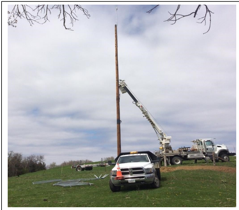
Figure 3: AC Skyways crew installs a 70-foot pole for a new micro-repeater site

Figure 3 illustrates one such approach, where AC Skyways crews set a 70-foot pole to serve as a “micro-repeater” site. Similar equipment has been placed on water towers, commercial radio towers, and grain elevators. As Foxwell says, “We are always on the lookout for good vertical property.” RF interference has at times been an issue, however. AC Skyways has encountered vegetation issues, as well as interference from another wireless service provider on the unlicensed 2.4 Ghz band.