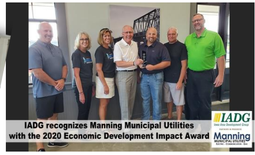
IADG recognizes Manning Municipal Utilities with the 2020 Economic Development Impact Award